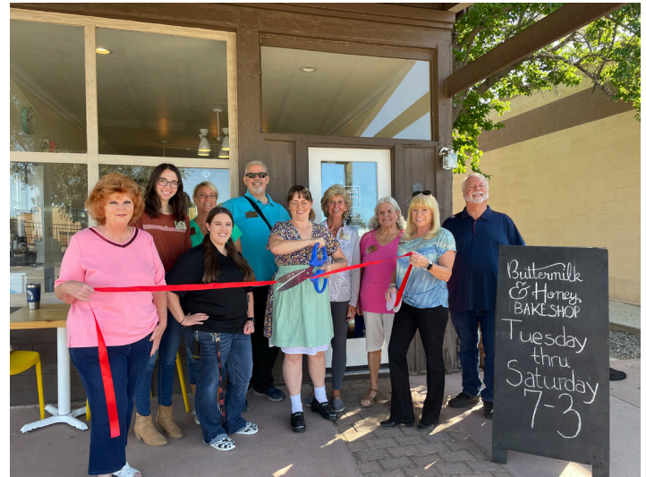
Buttermilk & Honey Bakeshop, Fanny Hicks Bakery 69 N. Frontier Street, Wickenburg, AZ 928-671-1333 buttermilk-honey-bakeshop.square.site