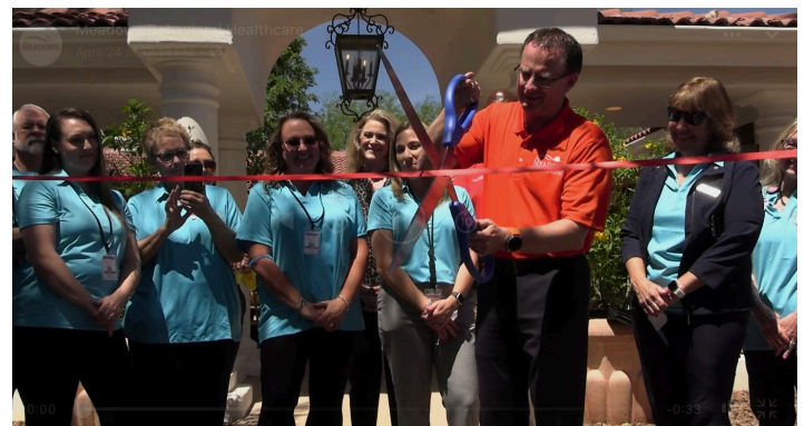
The Meadows Adolescent Center Behavioral Health Center 28331 W. Rocking Horse Lane, Morristown, AZ 928-668-1999 meadowsadolescent.com